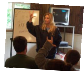
Belonging to God The I Love You Sign!