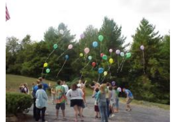
Releasing hurts; concerns to God. New Beginnings!