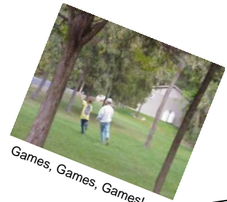
Games, Games, Games!