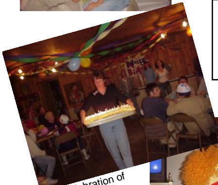
A celebration of Everyone!

Send Your Child to Camp It Makes a Difference!