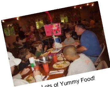
Lots of Yummy Food!