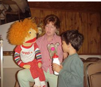
Learning to go from mad to glad!

Send Your Child to Camp It Makes a Difference!