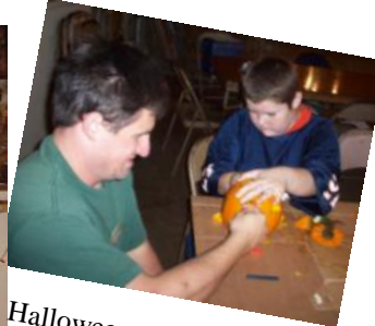
Halloween- getting the gunk out