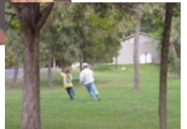
Games, Games, Games

Thanks to dozens of generous individuals and church groups, supporting funds, sleeping bags, pillows, towels, toiletries were provided for each child. Additionally, special treats including T-shirts, animal puppets, bubbles, Christmas stockings, water bottles, and colored markers and a host of other surprises are given. $150 is raised to cover the expenses of the camper, their mentor and a portion of the resource leaders. The camper's family pays only $5.00 for their children to participate in the fall program, and only $10 for their children to participate in the subsequent summer camp program.