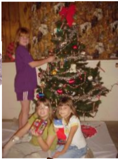
Friendships and Relationships