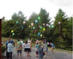
Releasing hurts, concerns and sins to God. New Beginnings!