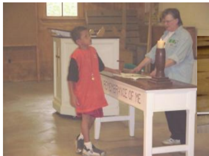
Offering ourselves to others. Good News posters for Kairos Weekends.