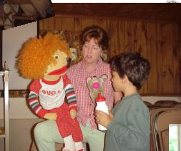
Learning to go from mad to glad!