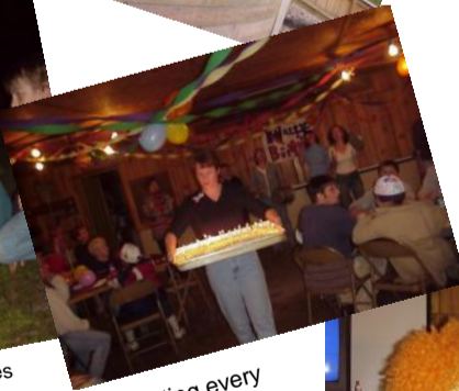
Celebrating every -one's Birthday