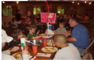
Lots of Yummy Food!