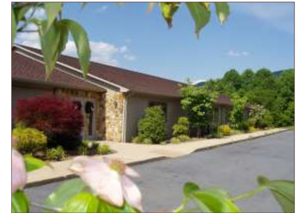
Blessings Lodge at Overlook

Wounded Hearts - Healing Love will be hosted at the Blessings Lodge. Nestled on the side of Massanutten Mountain, it overlooks the Shenandoah Valley and reminds us of God's creative, sustaining presence. Participants will stay in hotel-style shared rooms with private baths.